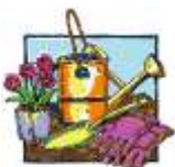
Dutch Bulb Preschool Fundraiser